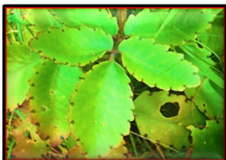
Fig. 1. Bryophyllum pinnatum Lam. (Oken)