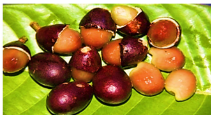
Fig. 1. Seeds and rind of Matoa ( Pometia pinata )

on previous research, it showed that research on the seed and rind of the matoa fruit has not been done much. One of the studies by Irawan in 2017, showed the presence of antioxidant activity in the rind and seed of the matoa fruit as much as 1195 µg/mL and 7656 µg/mL 4