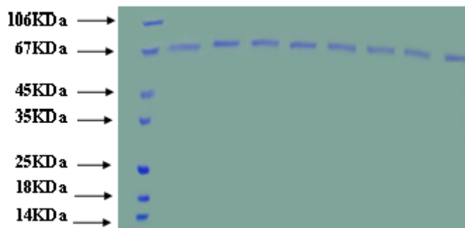
Fig. 2: 50% pellet SDS page of purified 70KDa protein (Volume loaded 20µl)

0.025 at 280nm. Mixture of proteins bound as a yellow zone at top of column was eluted with a linear 40mM-500mM NaCl gradient in buffer A at a flow rate of 25ml/hour. Gradient volume used was 5 times the bed volume of mini column [4ml]. Fractions of 0.5ml of the eluate collected.