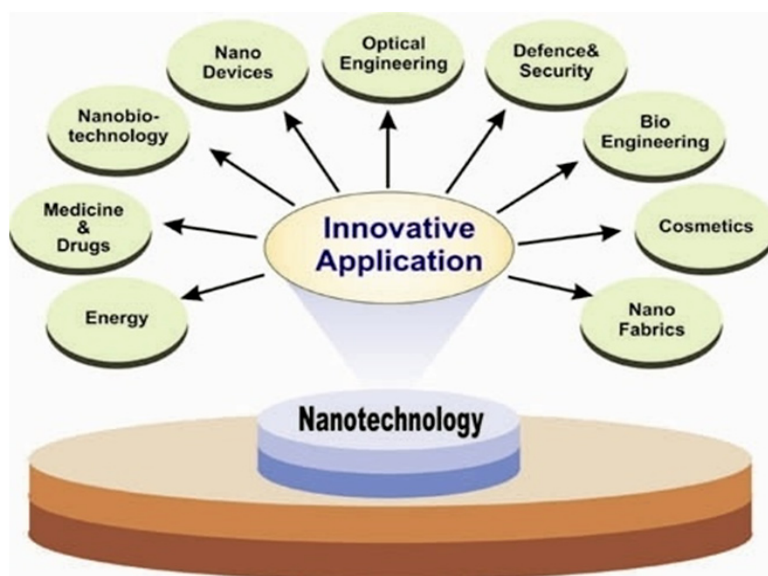
Fig. 1: Various applications of nanotechnology

Applications currently under development, some of which are likely to be commercially available in the next year or so, include: