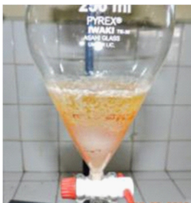
Fig. 1: Formation of soap during transesterification of rubber seed oil using CaO catalyst

Indonesia, is rubber ( Hevea brasiliensis ). The seed of this plant contains vegetable oil in substantial amount, ranging from 40 to 59% 1-2 , which makes this non-edible vegetable oil an interesting alternative raw material for biodiesel production. Despite this potential, unlike those derived from other raw materials, biodiesel derived from rubber seed oil has not reached the commercial stage. The main reason is probably due to the facts that rubber seed oil is more difficult to convert into biodiesel as a result of high free fatty acid (FFA) content in the oil which may reaches 18% 3 . In previous study 4 it was reported that the large quantity of FFA in vegetable oil led to simultaneous saponification and transesterification reaction.