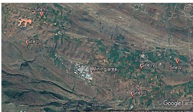
Fig. 1. Map showing the mining area and study locations

The objective of the present study is to assess the concentration of trace and heavy metals in soil and their accumulation by transfer into selected plants (vegetables, nuts, and fruits) grown in around mining area, and to estimate related health problems on human due to intake of these edible parts as diet.