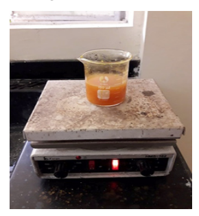
Fig. 3. Au-curcumin solution

The synthesized gold nanoparticle solution was mixed with the curcumin to make the complex as shown in the figure below. The presence of the orange color confirms the attachment of the curcumin with the gold nanoparticle.