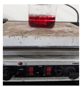
Fig. 1. Synthesized gold nanoparticles

The synthesized gold nanoparticle was brick-red in color. As shown in Fig. 1, the synthesized gold nanoparticle (AuNP) solution was brick red, along with the use of a laser pointer, which confirmed the presence of AuNP.